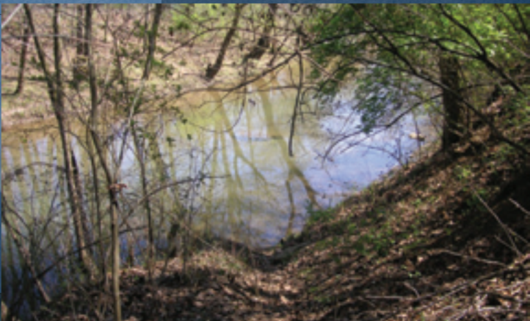
Buffalo Trace crossing Mansker's Creek Opposite Moss-Wright Park in Goodlettsville

This is a big, 11x14 book of 208 glossy full-color pages that describes every aspect of the spread of the settlers over an eleven-county area of today's Middle Tennessee including all or parts of Davidson, Sumner, Robertson, Williamson, Montgomery, Smith, Cheatham, Trousdale, Smith, Macon, and Jackson Counties.