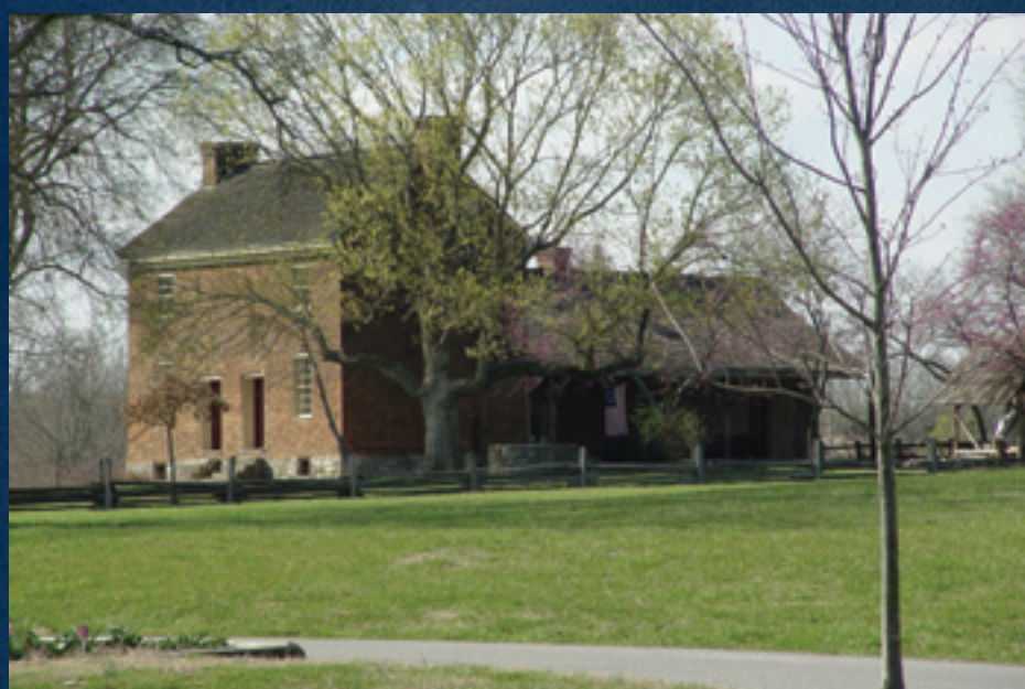
The Bowen House – Mansker's Fort Historical Park – Goodlettsville, TN